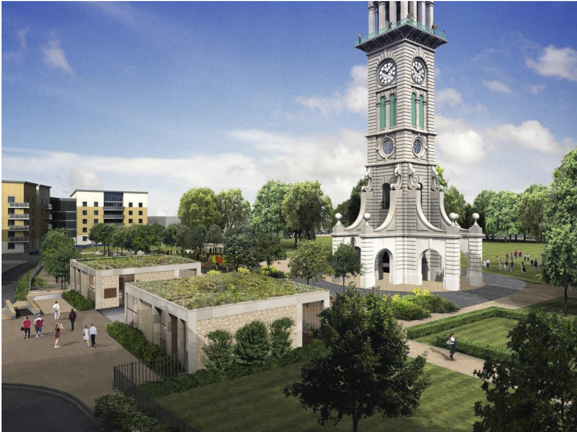
Image 5. View to the south east showing the proposed buildings and Clock Tower